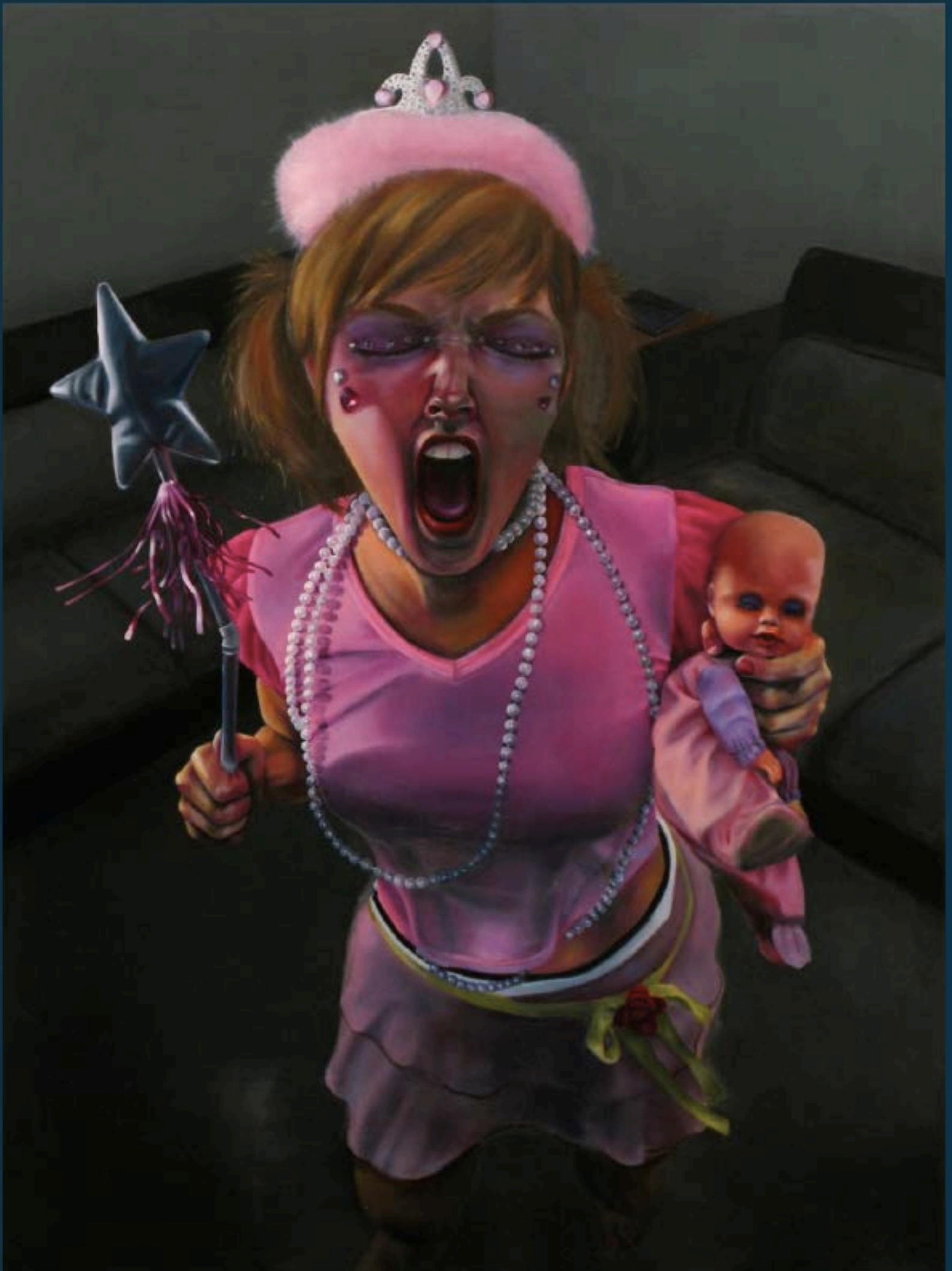
33 CONTEMPORARY GALLERY: Jessica Freudenberg - ... and I want it NOW! oil on panel 48"x36"x2"