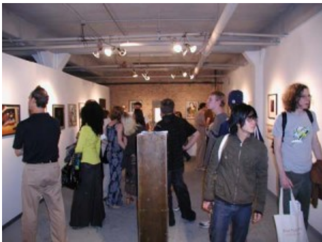
33 Collective Gallery in its early days